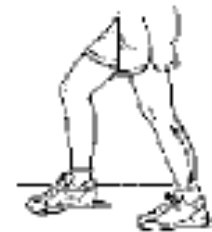
(Achilles Tendon) Hamstring Stretch